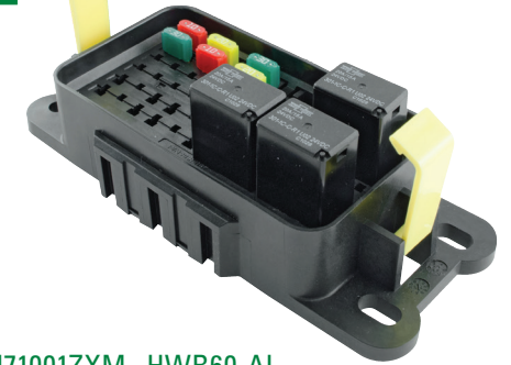
PDM71001ZXM - HWB60-AL