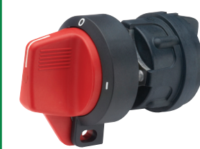
75920 Series - Battery Switches