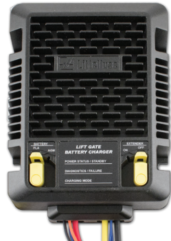
880211 - Liftgate Battery Charger