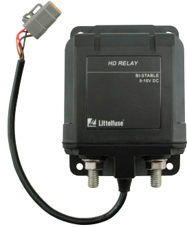
880086 - HD Series Relay