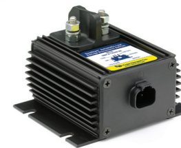
48513 - Low Voltage Disconnect