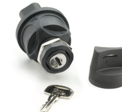
95060 Series - Ignition Switches