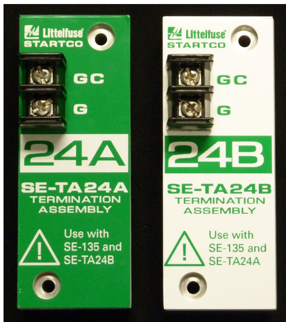
Figure 3: SE-TA24A and SE-TA24B Termination Assemblies